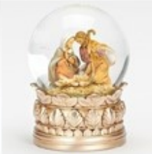
See all the NEW 2018 figurines, buildings and accessories