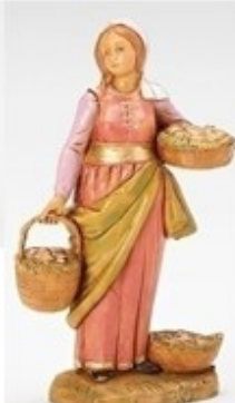
Limited Edition Dahlia $22.50

SHOP Fontanini Nativity Sets Buildings Figurines Animals and Accessories