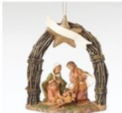
2018 Event Ornament available for one year